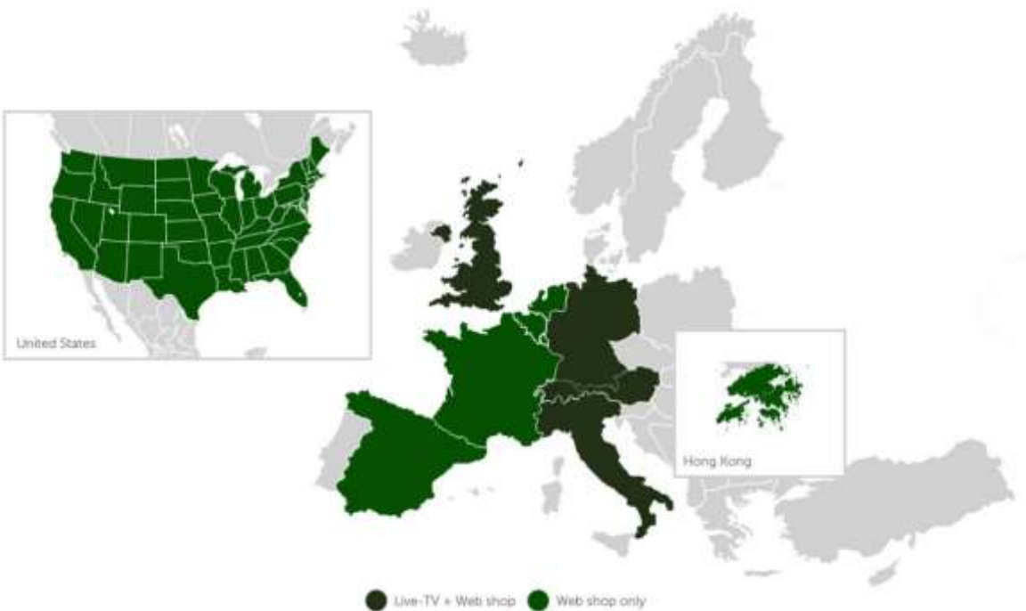
World-wide live TV and web shop sales of the elumeo Group